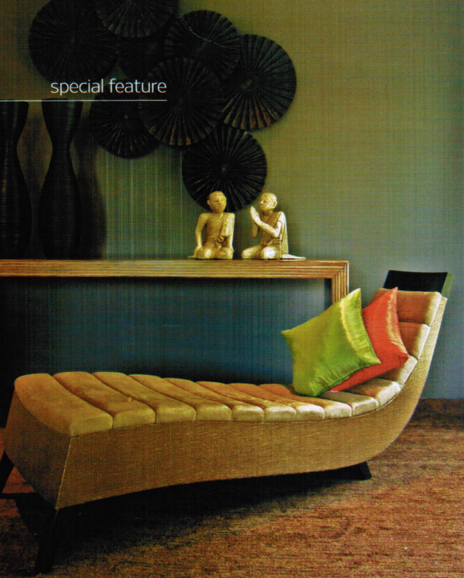
Above: The Padi meshes Asian lines with global sophistication